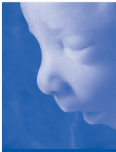
unborn child at 4 months

Abortion remains the supreme injustice and leading cause of human death in Minnesota today.