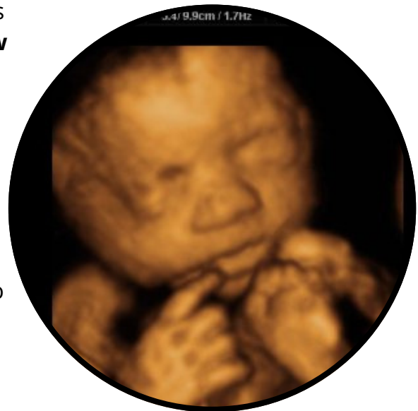
Baby in utero at 28 weeks

The abortion industry and its sympathizers want to make this about abortion. It's not. It's about infanticide -- something our society has always shunned as barbaric. While federal law does recognize that a baby born alive following an abortion is a person under the law, there are no requirements to provide care for the baby following a failed abortion. The Born-Alive Abortion Survivors Protection Act would require that the live baby born after an abortion be treated as a patient and given the same care that would be given to an infant of the same gestational age who was born not following an abortion. This legislation would also allow a mother to sue the abortionist if he or she fails to provide care for the newborn and harm results from a violation of the law. The mother is not penalized for any reason.