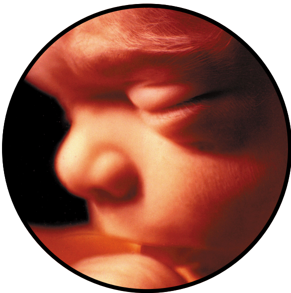
Baby in utero at 20 weeks